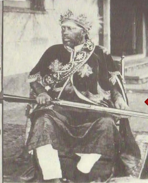
Photo 63: Kaiser Menelik mit Diadem und Gewehr, vor 1900

Miinilik duguugdu Sanyii Namaa (Menelik the DEMOCIDER)