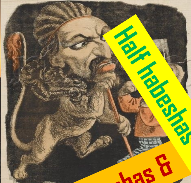
THÉODOROS, ROI D'ABYSSINIE