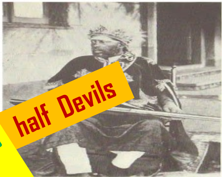
no 63: Kaiser Menelik mit Diadem und Gewehr, vor 1900